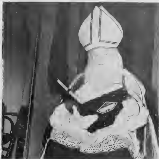
SINTERKLAAS, who knows everything, refreshes his memory (above) with his big book, which contains everything.